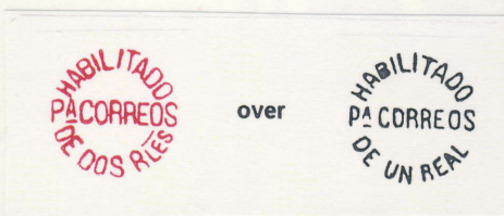
Double Surcharge - Red Two Reales (Type 8) on Black One Real (Type 5) on 2c Carmine Postage (APS Cert.)