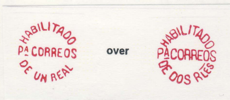
Double Surcharge - Red One Real (Type 5) on Red Two Reales (Type 8) on 2c Carmine Postage (APS Cert.)